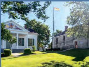
Court House & Gaol