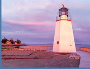
Pendlebury Light House