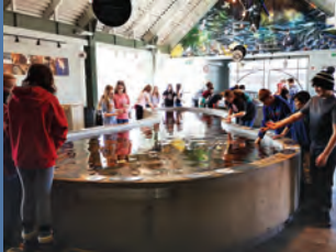
Huntsman Fundy Discovery Aquarium