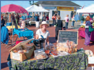
St. Andrews Farmers' Market