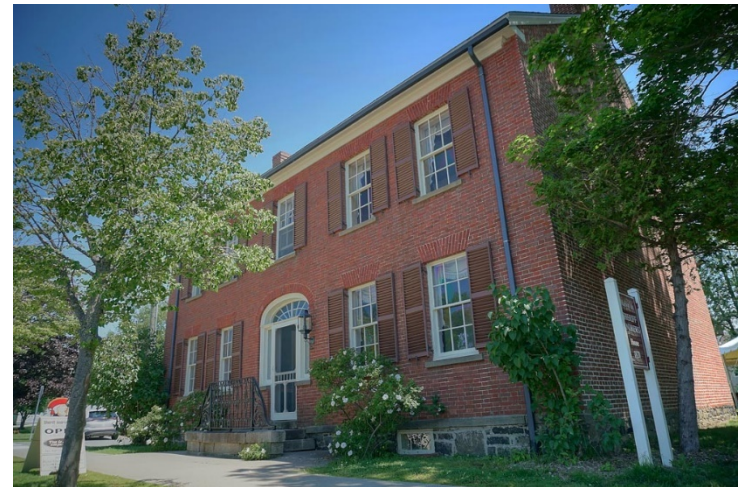
Sheriff Andrews House 200 th Anniversary Celebration in 2020